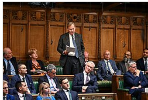
Rupert Lowe speaking in parliament, 2025

The party also cited complaints from staff about derogatory and discriminatory remarks about women and reported the matter to the police, after which the Metropolitan Police passed a file to prosecutors. Lowe and his seven parliamentary staff denied the allegations in an open letter, describing them as false and vexatious , and noted that his suspension and police referral came the day after he had publicly raised concerns and criticised party leader Nigel Farage in a media interview. [7][8][9] On 9 March 2025, Lowe stated that he believed Nigel Farage was "watering down" Reform UK's policy on the deportation of illegal migrants. [10]