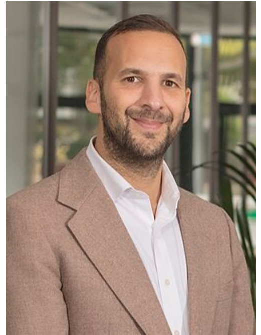
Polanski in 2022

Leader of the Green Party of England and Wales