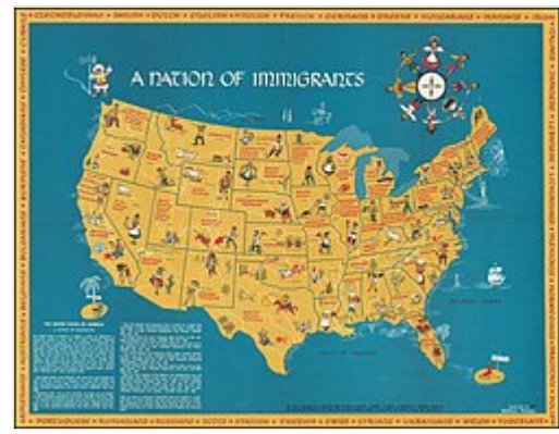
The book includes a map.