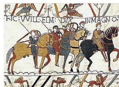
Normans, as portrayed here on the Bayeux Tapestry , were an elite who made up an estimated 2% of England's population.