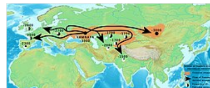
Bronze Age spread of Yamnaya Steppe pastoralist ancestry. The Yamnaya culture is identified with the late Proto-Indo-Europeans .

The first Roman invasion of Great Britain was led by Julius Caesar in 55 BC; the second, a year later in 54 BC. The Romans had many supporters among the Celtic tribal leaders, who agreed to pay tribute to Rome in return for Roman protection. The Romans returned in AD 43, led by the Emperor Claudius , this time establishing control, and establishing the province of Britannia . Initially an oppressive rule, gradually the new leaders gained a firmer hold on their new territory which at one point stretched from the south coast of England to Wales and northwards as far as southern Scotland .