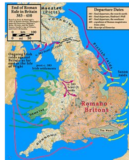
End of Roman rule in Britain, 383–410

The earliest date given for a Viking raid of Britain is 789 when, according to the Anglo-Saxon Chronicle , Portland was attacked. A more exact report dates from 8 June 793, when the cloister at Lindisfarne was pillaged by foreign seafarers. These raiders, whose expeditions extended well into the 9th century, were gradually followed by armies and settlers who brought a new culture and tradition markedly different from that of the prevalent Anglo-Saxon society of southern Britain. The Danelaw , established through the Viking conquest of large parts of the Anglo-Saxon cultural sphere, was formed as a result of the Treaty of Wedmore in the late 9th century, after Alfred the Great had defeated the Viking Guthrum at the Battle of Ethandun . Between 1016 and 1042 England was ruled by Danish kings. Following this, the Anglo-Saxons regained control until 1066.