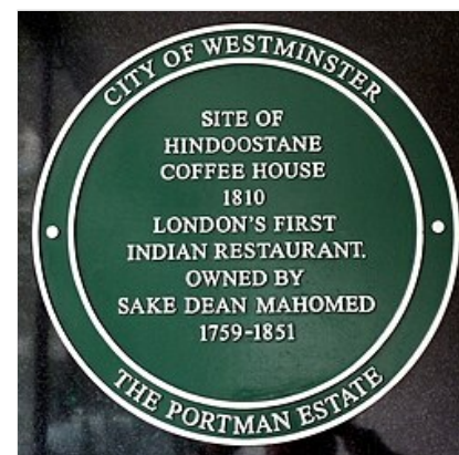
Plaque commemorating Sake Dean Mahomed and Britain's first Indian restaurant that he opened in 1810

The number of seamen from the East Indies employed on English ships was felt so worrisome at that time that the English tried to restrict their numbers by the Navigation Act 1660 , which restricted the employment of overseas sailors to a quarter of the crew on returning East India Company ships. The number of lascars employed on EIC East Indiamen was so great that the Parliament of England restricted their employment via the Navigation Acts (in force from 1660 onwards) which required that 75% of the crew onboard English-flagged ships importing goods from Asia be English subjects. [57] In 1797, thirteen were buried in the parish of St Nicholas at Deptford . Between 1600 and 1857, around 20,000 to 40,000 Indian seamen, diplomats, scholars, soldiers, officials, tourists, businessmen and students in Great Britain had travelled to Britain, mostly temporarily. [58] Most Indians during this period would visit or reside in Britain temporarily, returning to India after months or several years, bringing back knowledge about Britain in the process. [59] In 1855 more than 25,000 of these were lascar seamen working on British ships. [60][61][62]