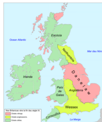
Territories controlled by the Vikings (red), Anglo-Saxons (yellow) and Celts (green) in the 9th century

The Huguenots , French Protestants facing persecution following the revocation of the Edict of Nantes , began to move to England in large numbers around 1670, after King Charles II offered them sanctuary. Most came from regions in western France such as Poitou , and in all some 40–50,000 arrived. [54] Though many towns and cities in England served as destinations for the Huguenot migrants, the largest number settled in the Spitalfields